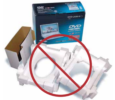
Larger package, multi-materials needed, more storage, more waste.