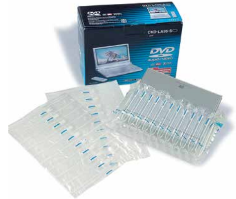
Same product, better pack.