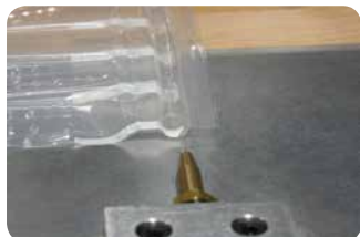
Opens valve for easy filling

The compact inflation unit gauges the necessary pressure, opens the inflation valve and fills the bag in seconds. It clamps onto any tabletop and attaches to existing compressed air sources.