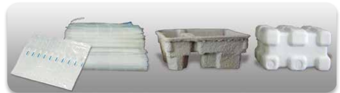
100:1 space savings

ChamberPak competes against a multitude of bulkier, more costly, less environmentally appealing packaging solutions.