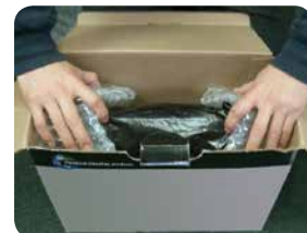
Ready to load into carton and ship.