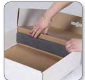
Stick to the box interior where needed.