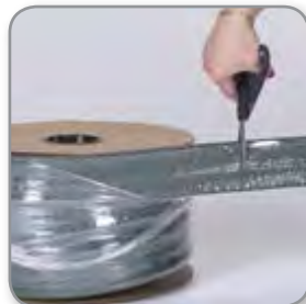
Cut to length off of the roll of foam.