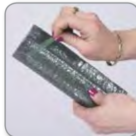
Peel the film liner off to expose adhesive.